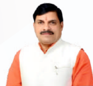
Dr. Mohan Yadav Chief Minister, Madhya Pradesh