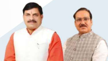
Dr. Mohan Yadav Chief Minister, Madhya Pradesh